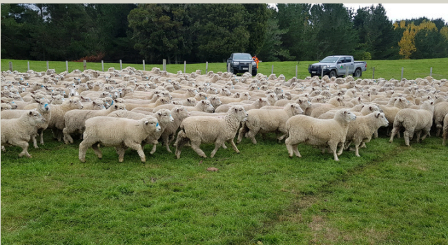
Annual Stock Count