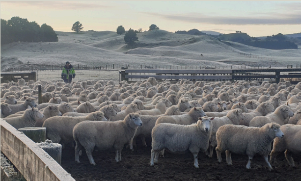
Annual Stock Count