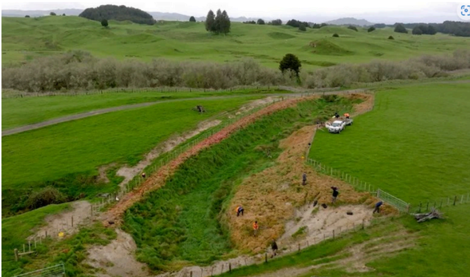
Te Hape B Trust planting day with PGG Wrightson

We look forward to improved times in the future but remain comforted that the Trust is not alone on this journey and the challenges being faced are by all farmers and as a country we have been here before, and come out the other side stronger.