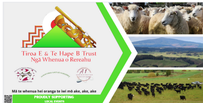
Trusts Banner Displayed at the Les Munro Center for the NZ Shearing Championships