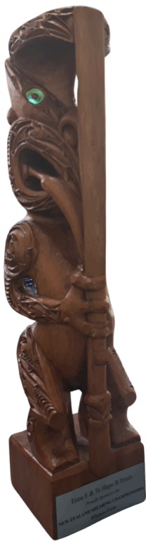
Winners Trophy Proudly Sponsored by Tiroa E & Te Hape B Trusts