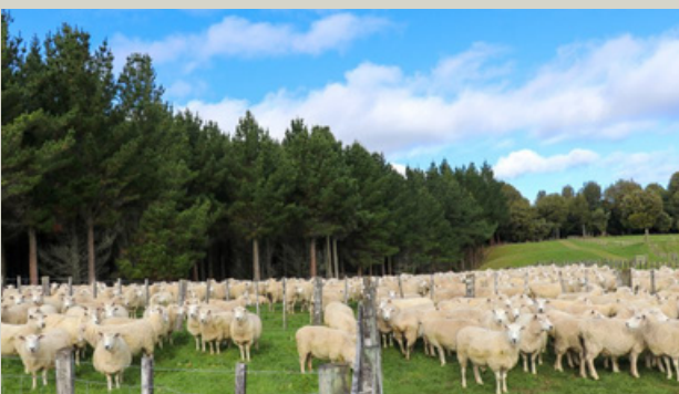
Annual Stock Count