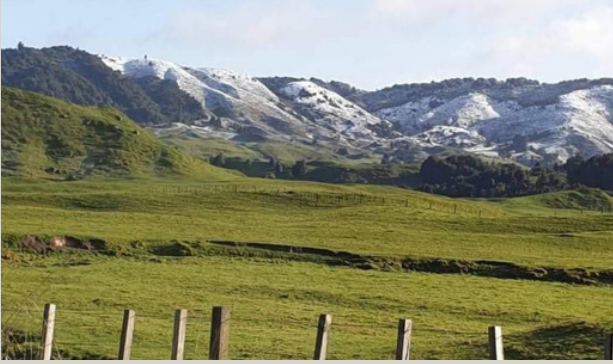
Snow on the hills