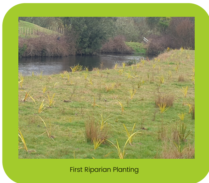
First Riparian Planting

Damien Riordan - Tiroa Station Hayden Simpson - Te Hape Station Angus Valler - Te Hape Station Malachi Waaka - Te Hape Station George Hobbs - Te Awa Rua Farm