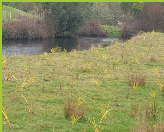
First Riparian Planting

Damien Riordan - Tiroa Station Hayden Simpson - Te Hape Station Angus Valler - Te Hape Station Malachi Waaka - Te Hape Station George Hobbs - Te Awa Rua Farm