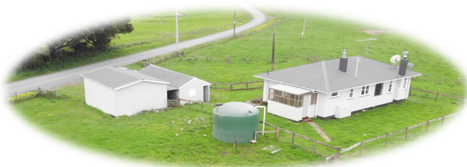
1993 Mangaokewa Road - Wharekiri Station 2020

Upgrading of all farm dwellings continues. New floor coverings, exterior & interior painting, double glazing, new drapes and building maintenance work where required. Annual fire place & smoke alarms checks have been completed prior to winter.