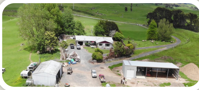
Wharekiri Managers House and New Implement Shed