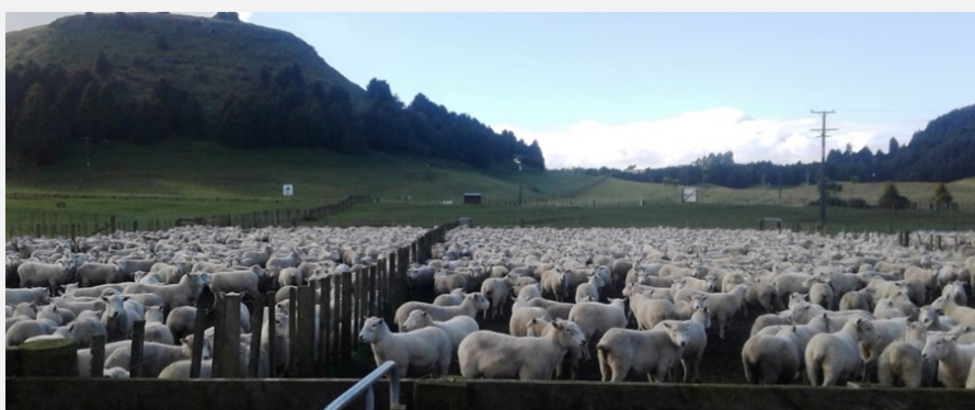
Te Hape Station - June 2018

All dwellings have been thoroughly inspected and maintenance is ongoing. All houses are now fully insulated. Repairs and painting internally and externally has been completed in some. Old worn carpet, vinyl and curtains have also been replaced. We will be replacing all windows with double glazing in the near future – this will help keep the heat inside in the cold winter months. Plans have been drawn up for Farm manager dwelling renovations and upgrades.