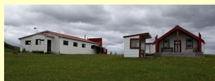
Te Hape Marae

All grants were paid on 5 th March 2018. We wish them all the best with studies and future endeavours.