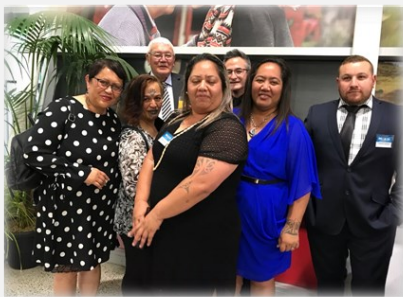
Left: Trustees with FOMA members at the 2017 Conference.

We attended the conference in November 2017 held in Rotorua it included a 30-year celebration of FOMA's contribution to the Maori economy and to our national economy that we know today.