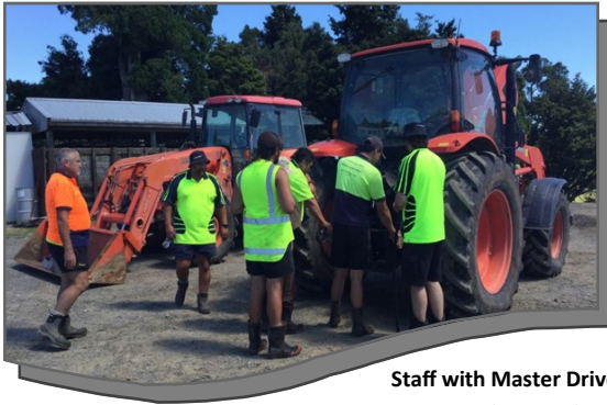
Staff with Master Drive Trainer Tiroa Station

All farm staff have completed training with Master Drive Services. Feedback was very positive from staff, trustees and trainers.