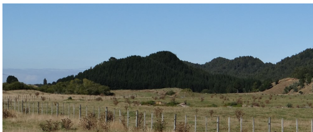
Te Hape Forestry 2018