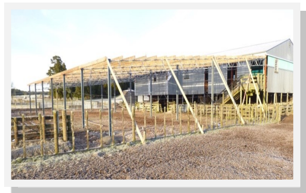
Covered Yards in Progress Wharekiri Station Woolshed